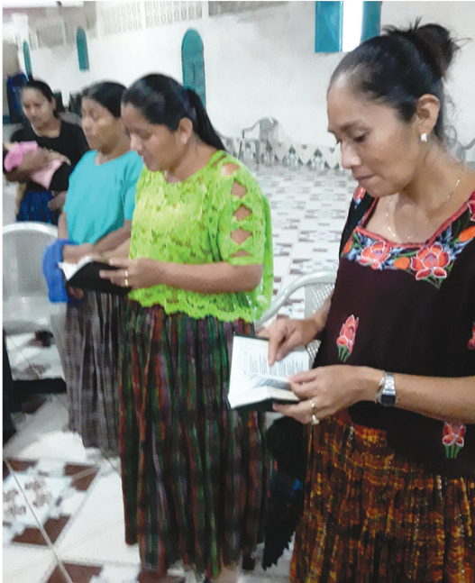
Q'qechi Women's Group