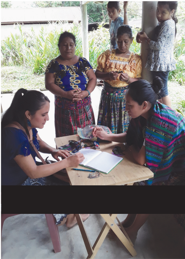
Ixcán Creations Women